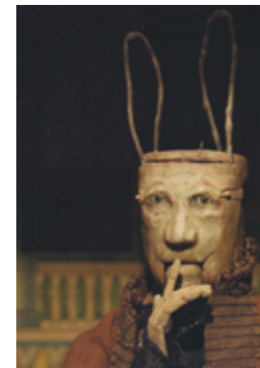
Below: Mr. R. in the Portico, 16 x 16 x 4 in.; wood, fabric, glass eyes, and found objects over stainless steel armature.